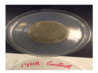
Whatman Filter Paper