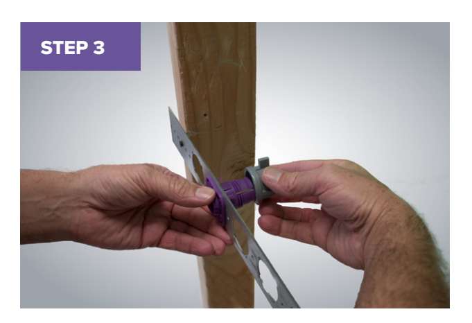
Snap the grey nut onto the back of the purple insert.