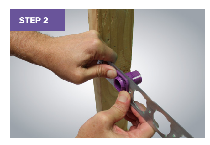
Snap the main purple body of the insert into the front of the bracket.