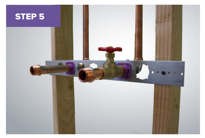
Installation is complete.