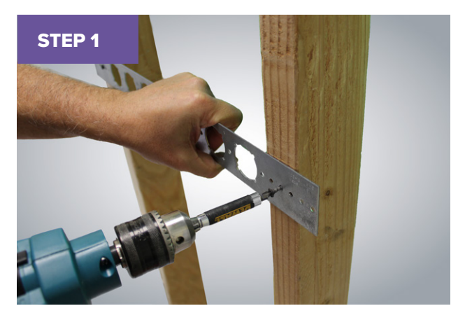
Install a PEXRITE (#103-18/103-26) bracket onto the front of wall studs.